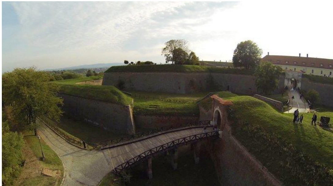
System of tunnels and underground, passages

A unique, scenic fortress built by the Habsburg empire in the 17 th century, situated on the Danube, overlooking Novi Sad.